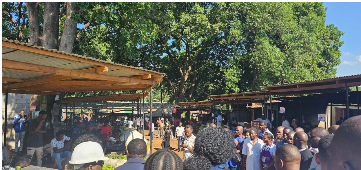
Figure 2. Market shelter installed throughout the market