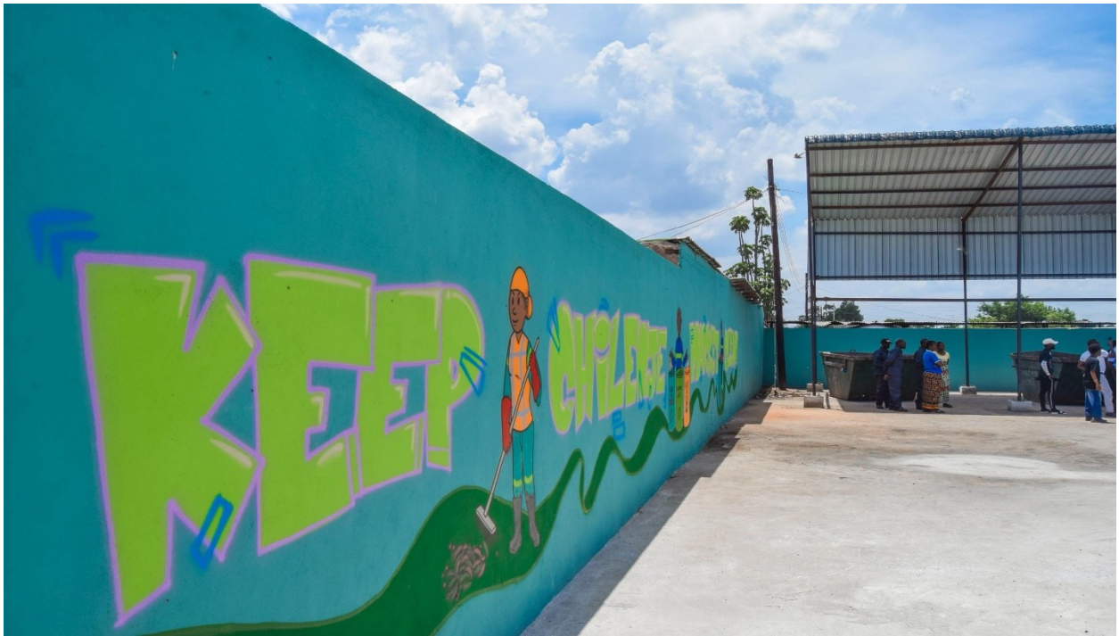
Figure 8. Waste management “Market Clean” mural Keep Chilenje