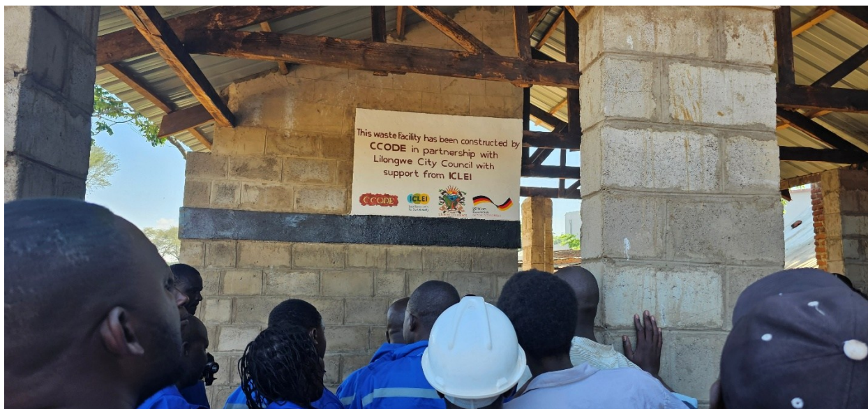
Figure 3. Waste facility for organic manure/fertilizer