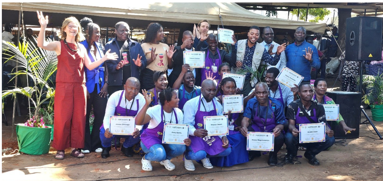
Figure 1. Participants in the waste management training