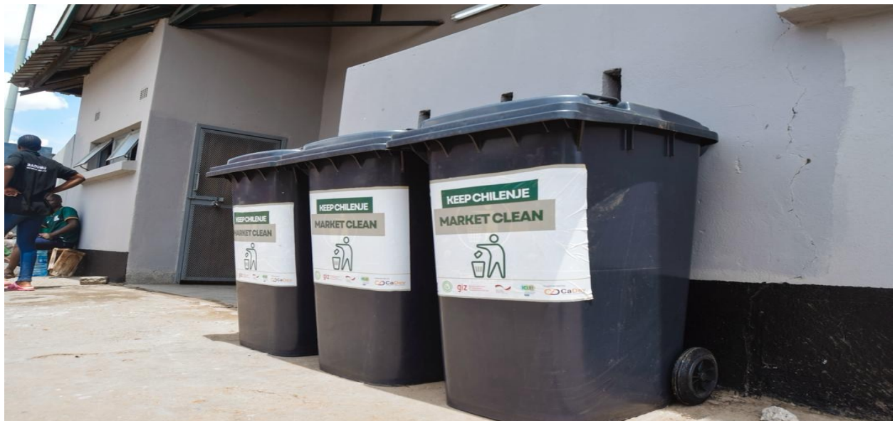
Figure 6. Waste bins added at the toilet area