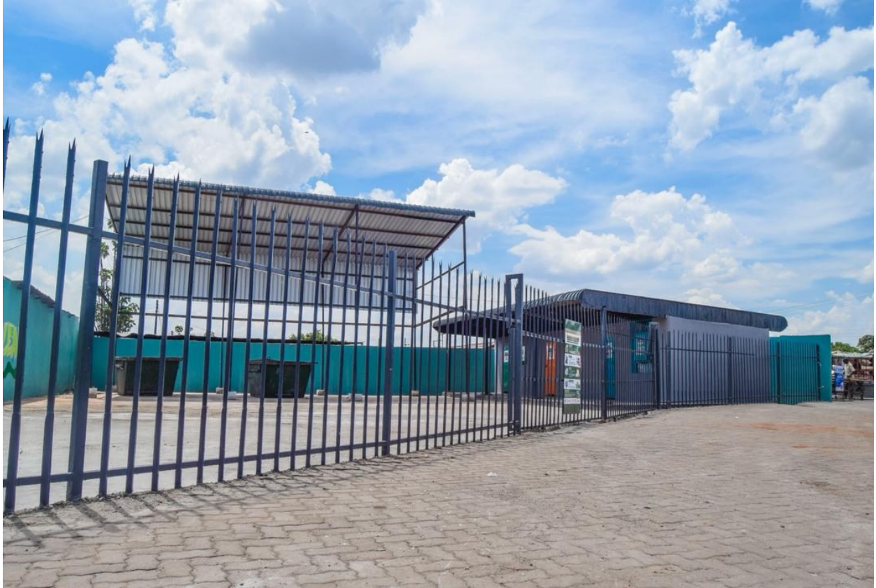
Figure 4. Improved waste separation area