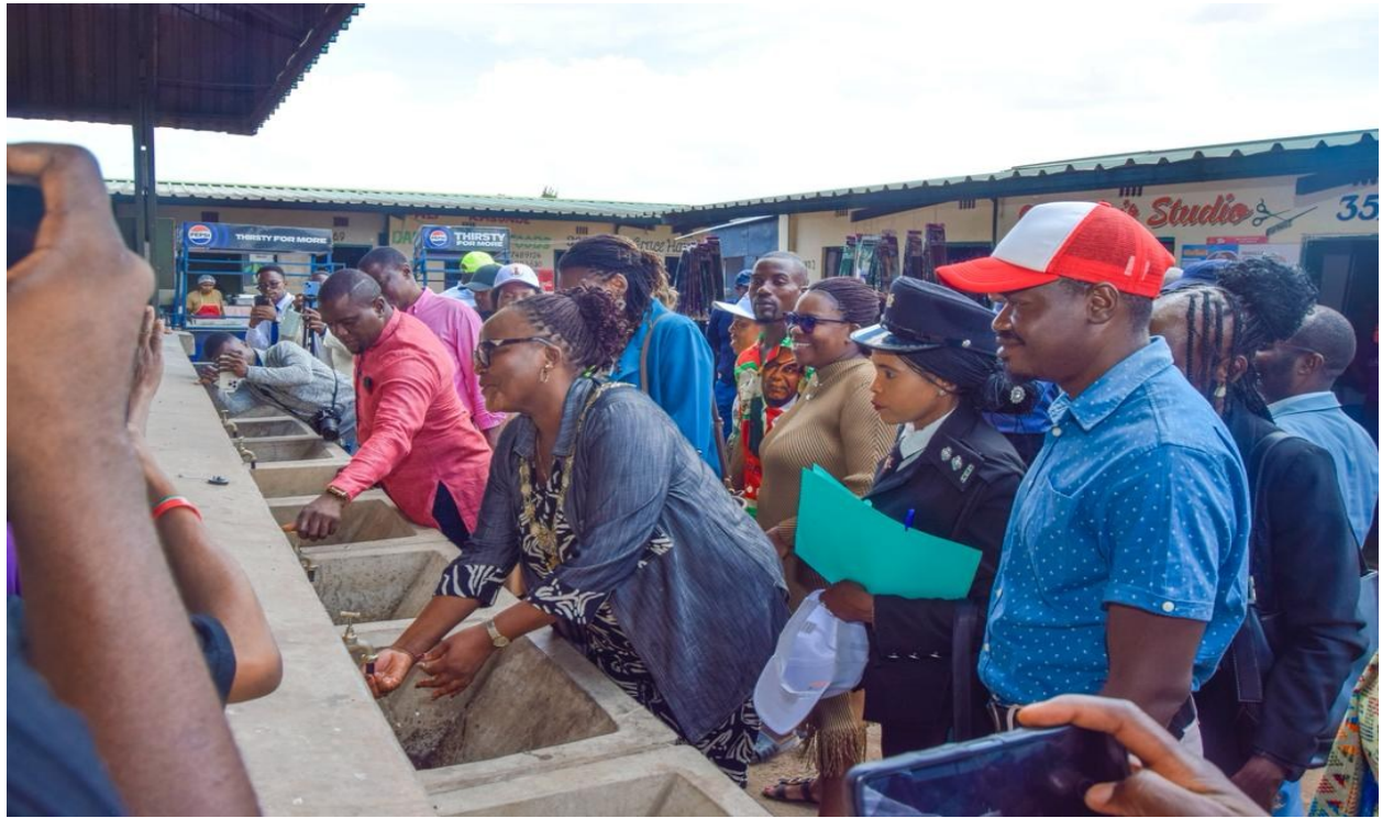
Figure 5. Improved water reticulation, 13 taps were added to the lone existing tap in the market