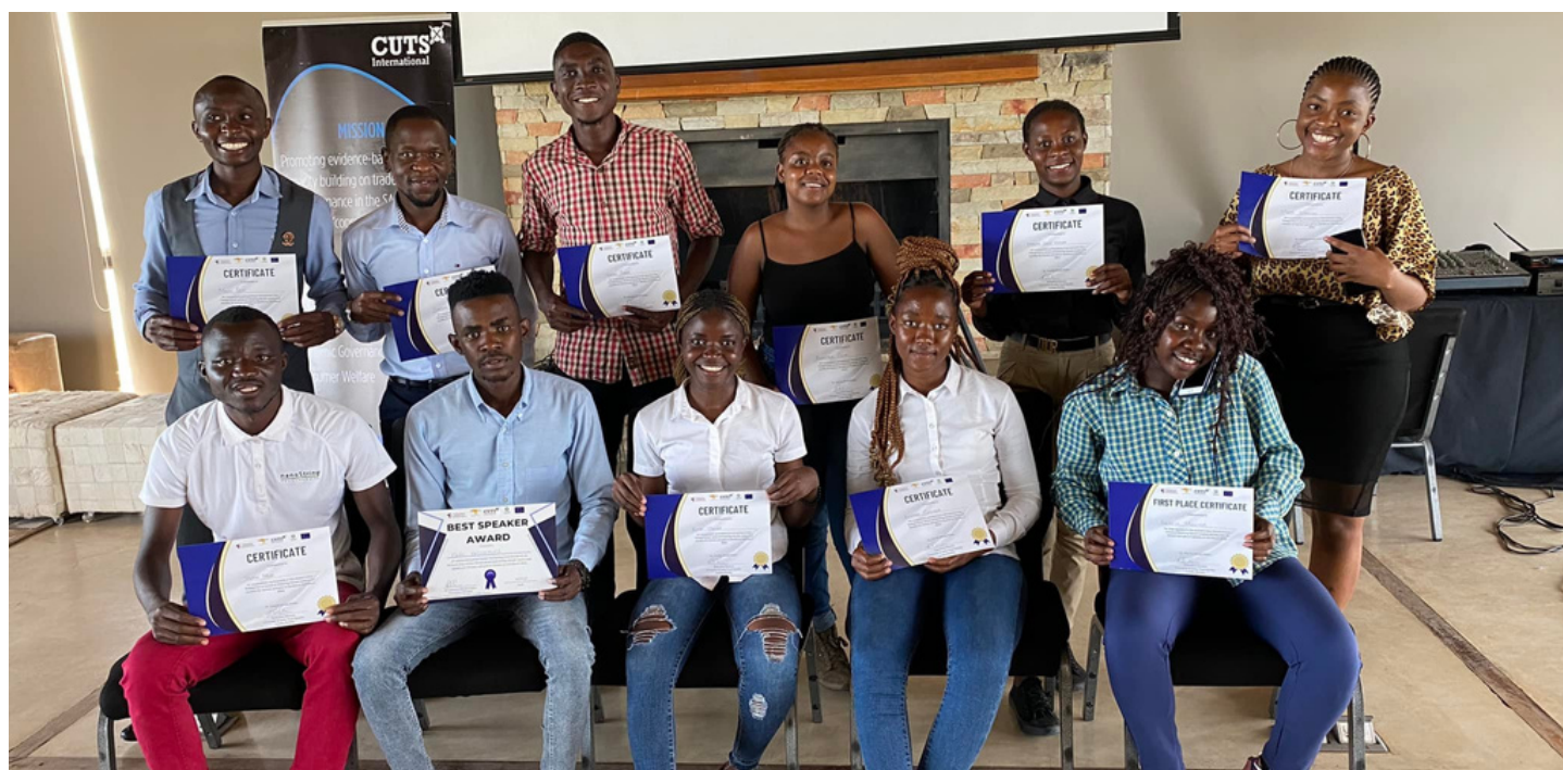
Women's Day Youth Debate Forum