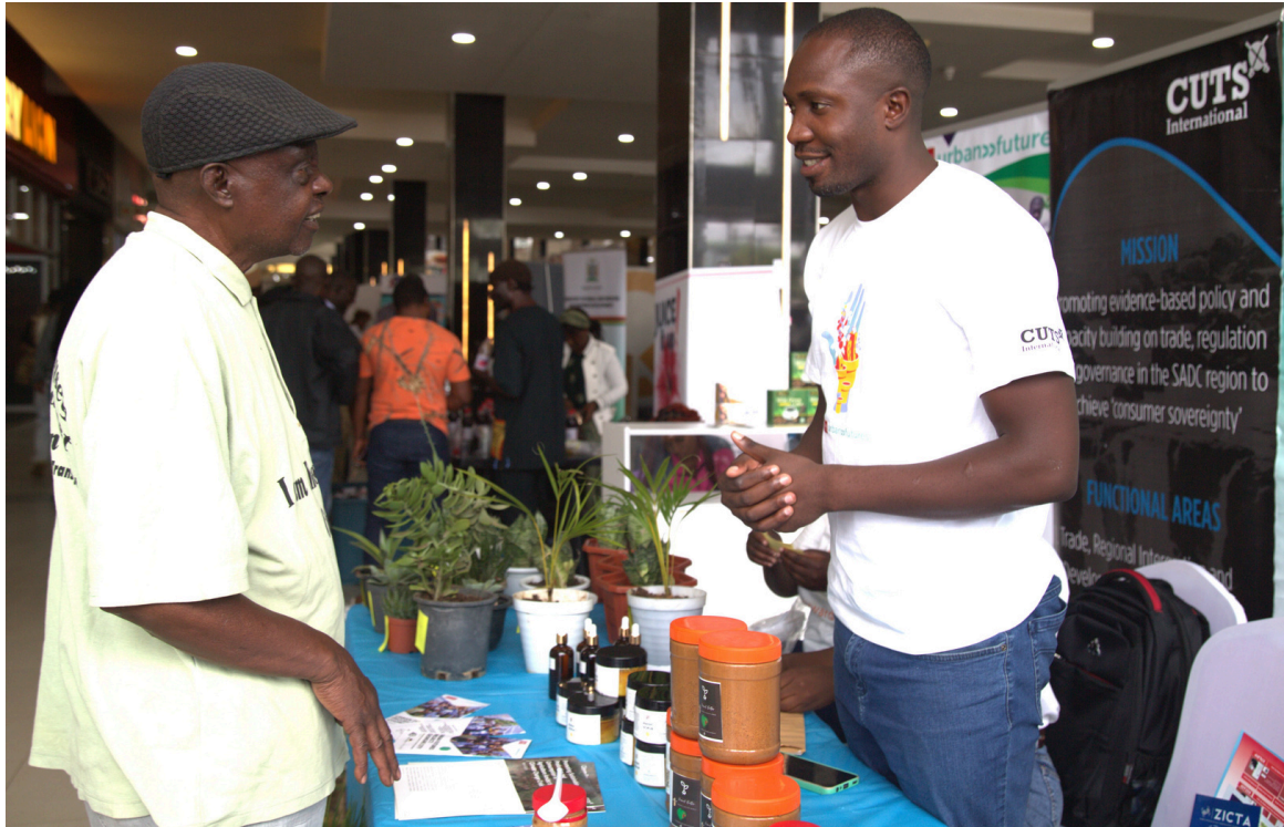
Left Mainza engaging with a stakeholder.