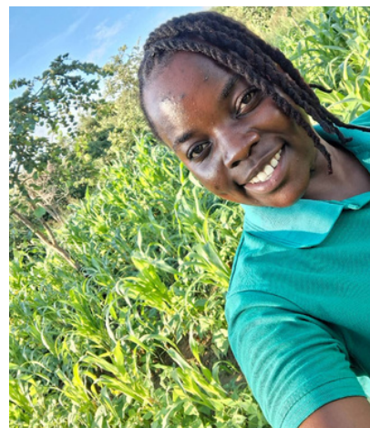
On the left in the field planting maize and beans.