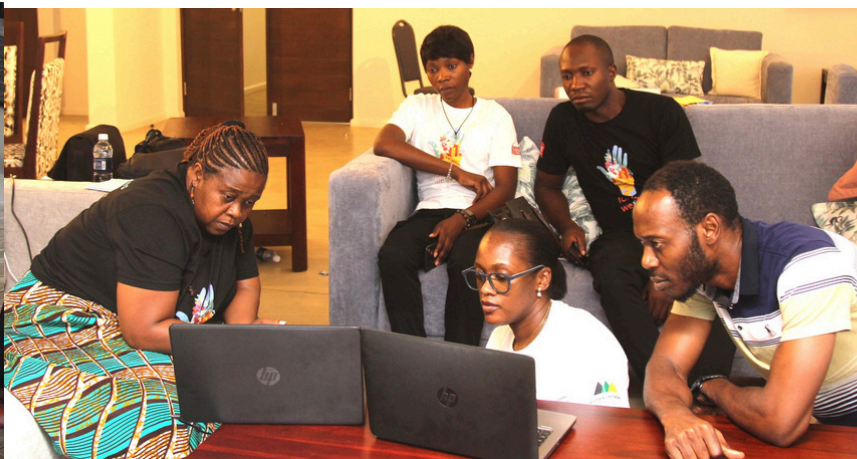
GNS Team with UF youths